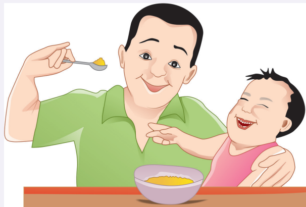
Fig. 5: Practice responsive feeding.