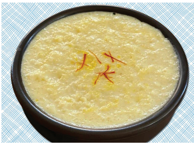
Fig. 2: Kheer is one of the examples of balanced food.