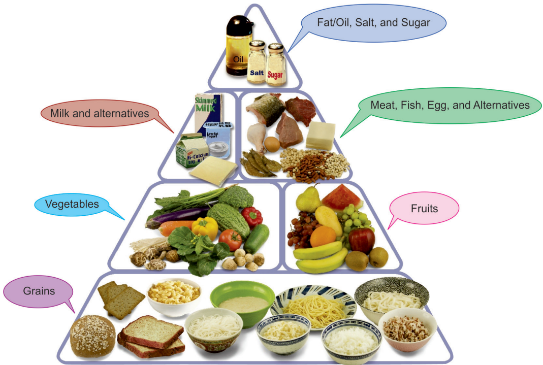
Fig. 1: Combination of these makes a balanced food.