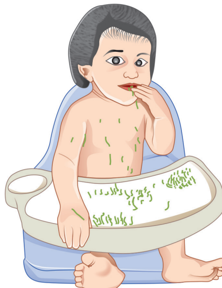
Fig. 3: Baby-led weaning.